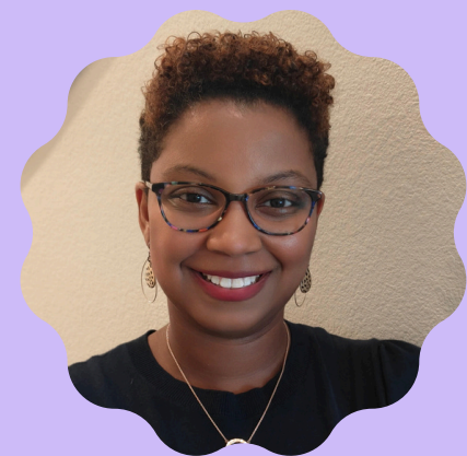
Raven Hall Middle School Teacher