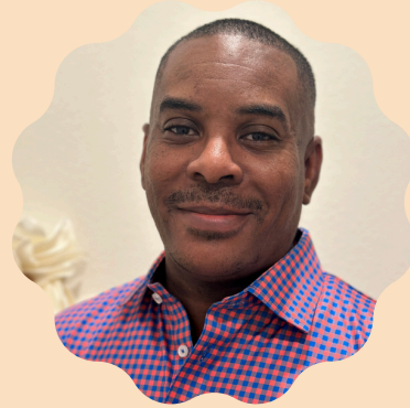
Cedric Hall Middle School Teacher